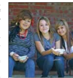
Students enjoying sundaes on the 1st day of school

students and staff get better acquainted. Janus employees scooped the ice cream and chocolate syrup for a long line of students in the warm summer sun, and later