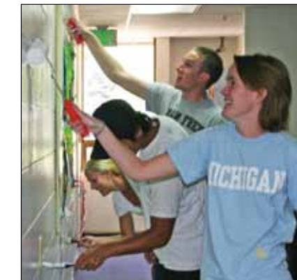
Dish Network Interns painting the hallway