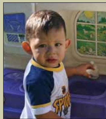
Fun on the ELC Playground

... We really look at what each baby needs individually, and provide the curriculum that meets their needs."